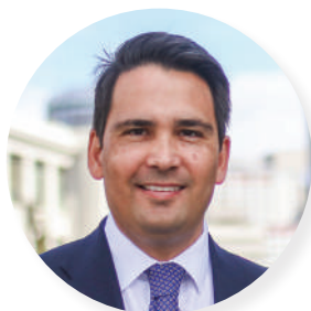
Hon Simon Bridges National Party Leader