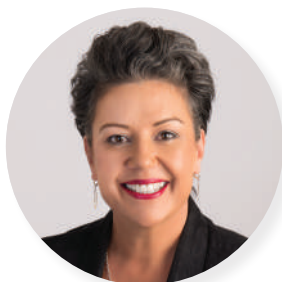
Hon Paula Bennett Spokesperson for Drug Reform