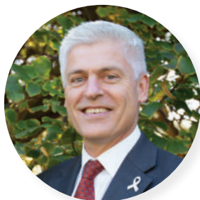
Hon Tim Macindoe Shadow Attorney-General