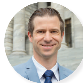
Chris Penk Spokesperson for Courts