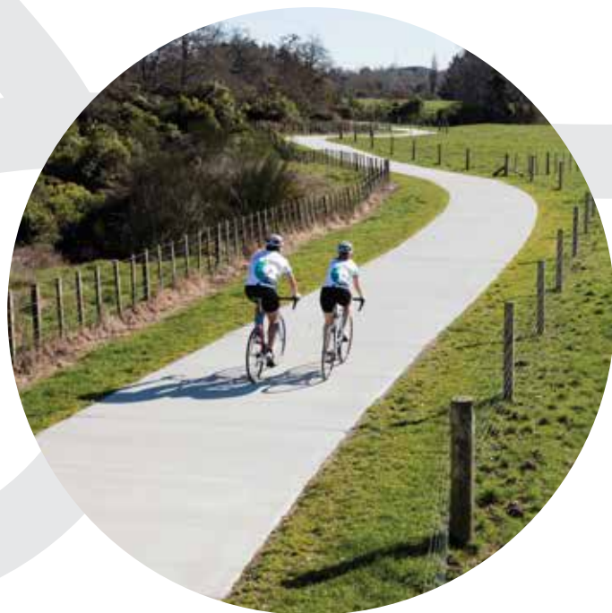
Te Awa: The Great New Zealand River Ride

More than just a cycle track, Te Awa is an inspiring example of what can be achieved when we make the best of what the mighty Waikato has to offer.