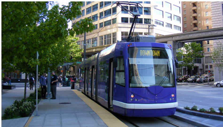
Figure 1. Light rail in Seattle, Washington