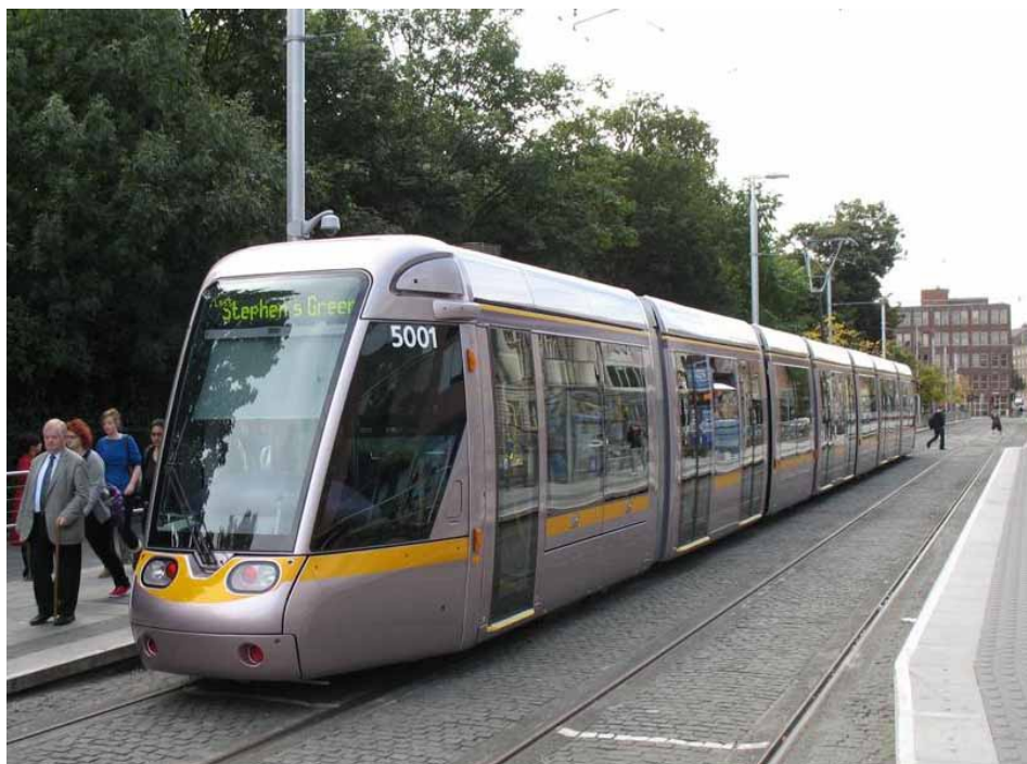
Figure 5. Light rail in Dublin, Ireland