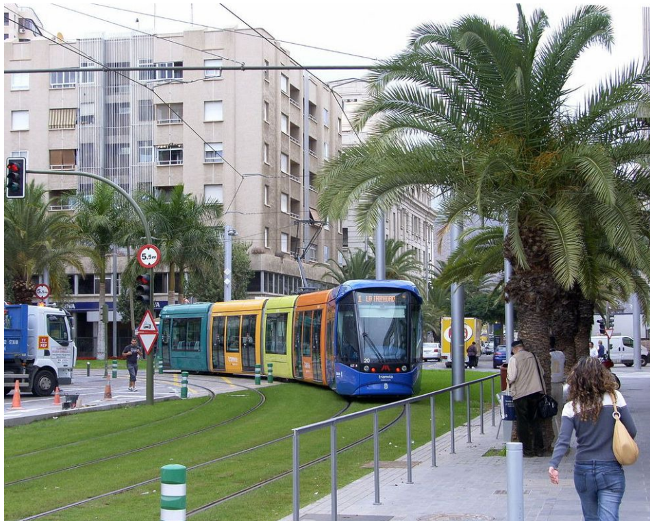
Figure 2. Light rail in Tenerife, Spain