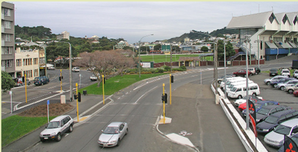
The northern view of Basin Reserve Cricket Ground roading to be improved as part of the Road of National Significance.

This section includes improvements to the highway to the north of the Basin Reserve Cricket Ground to separate north/south vs east/west traffic movements and provides the opportunity to enhance public transport.