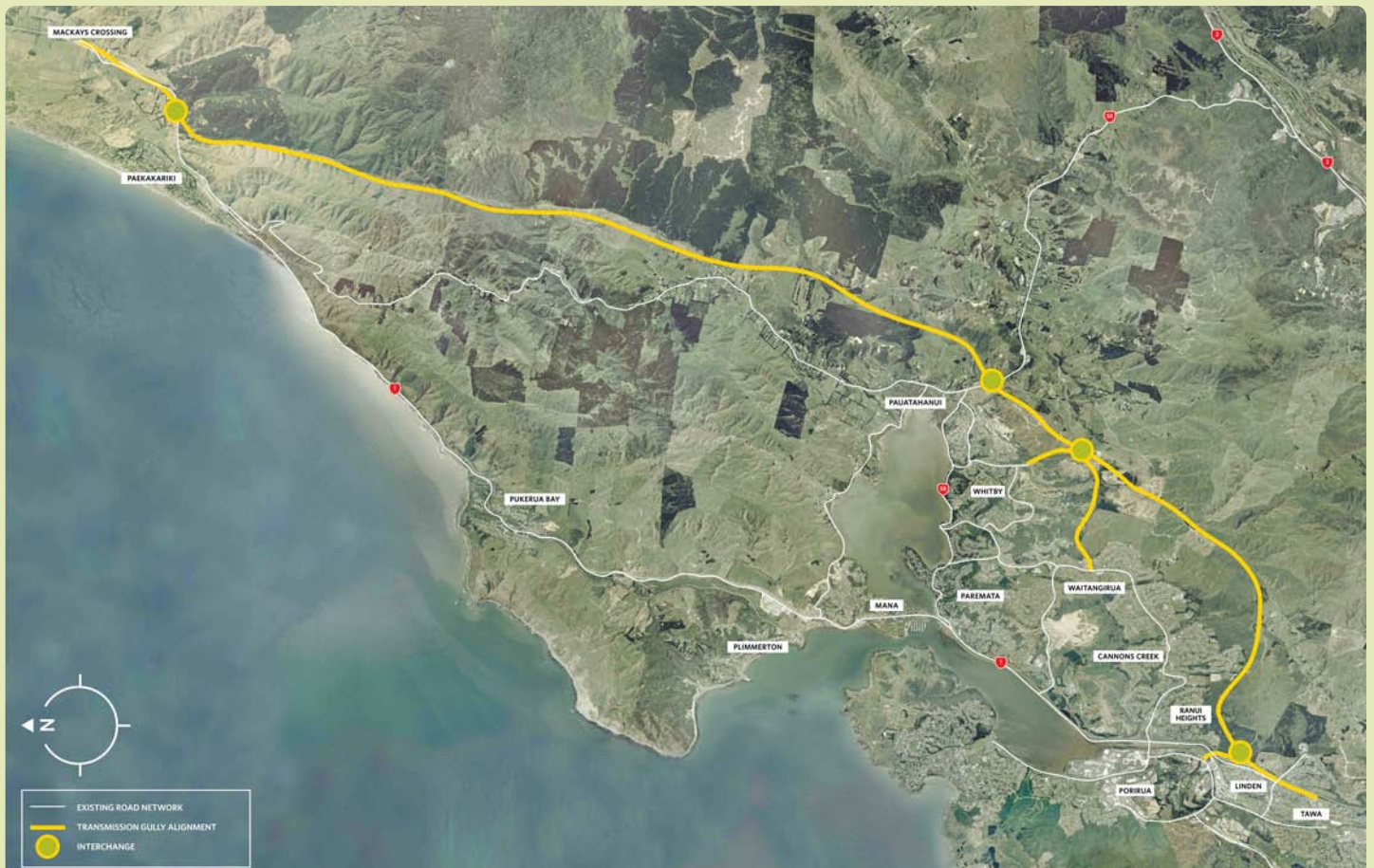
The previously identified preferred route for Transmission Gully between Linden and Mackays Crossing.

This section includes the establishment of the Transmission Gully motorway.