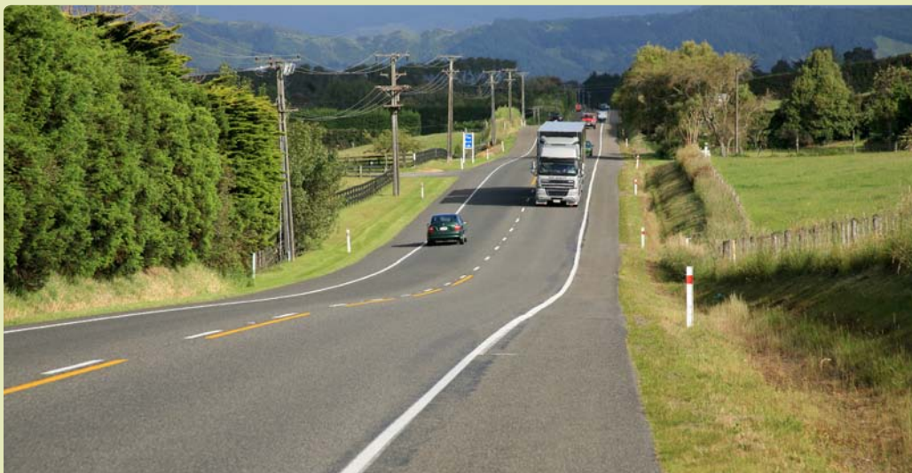
The view of the current highway to Levin looking northwards.

Three components make up this northern most section of the Wellington Road of National Significance. This is the four-laning of Otaki to Levin, Levin Bypass and improvements to the section north of Levin to include passing lanes.