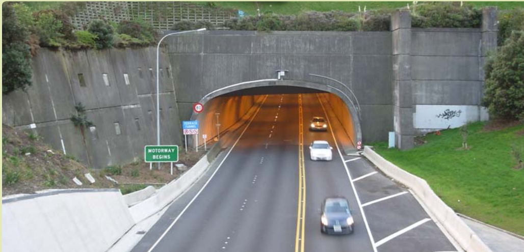
The southern portal entrance to the Terrace Tunnel. Completed in 1977, it was originally designed to have a twin. The Road of National Significance will realise the original plan.

This section includes the duplication of the Terrace Tunnel, which was originally considered in the 1970s when the existing tunnel was designed.