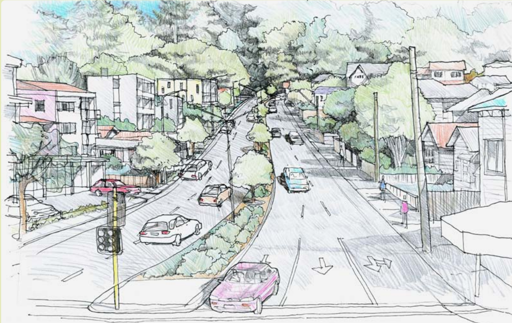
An artist's impression of a widened Wellington Road provided during consultation on the Ngauranga to Airport Strategy Study in 2008. Detailed design has not been undertaken on this section yet and will include discussions with the local community.

This section includes four-laning Ruahine Street, installing traffic signals at the intersection with Wellington Road and duplicating the Mt Victoria Tunnel.