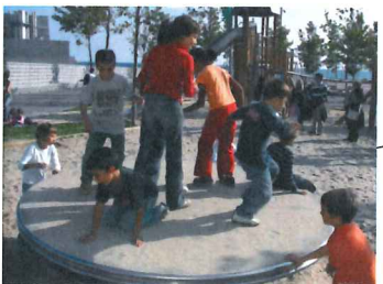
BALANCE DISC FOR GROUP PLAY