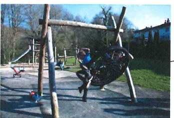
BASKET SWING FOR GROUP PLAY , INFANTS & DISSABILITY