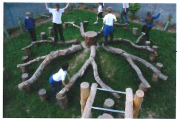
MOUNDED LOG CLIMB/PLAY ZONE FOR GROUP PLAY