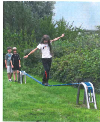
LOW ROPE BALANCE BRIDGE BETWEEN LOG & ROCK BALANCE STEPS