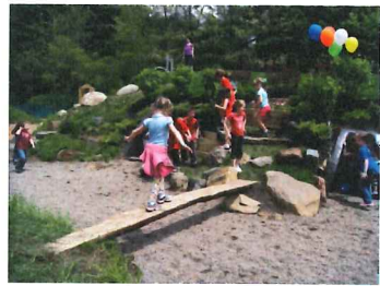
LOG BALANCE BRIDGE ZIG ZAGS ACROSS ROCK SWALE CHANNEL CONNECTING BUSH CHAPEL TRACK WITH GROUP PLAY ZONE