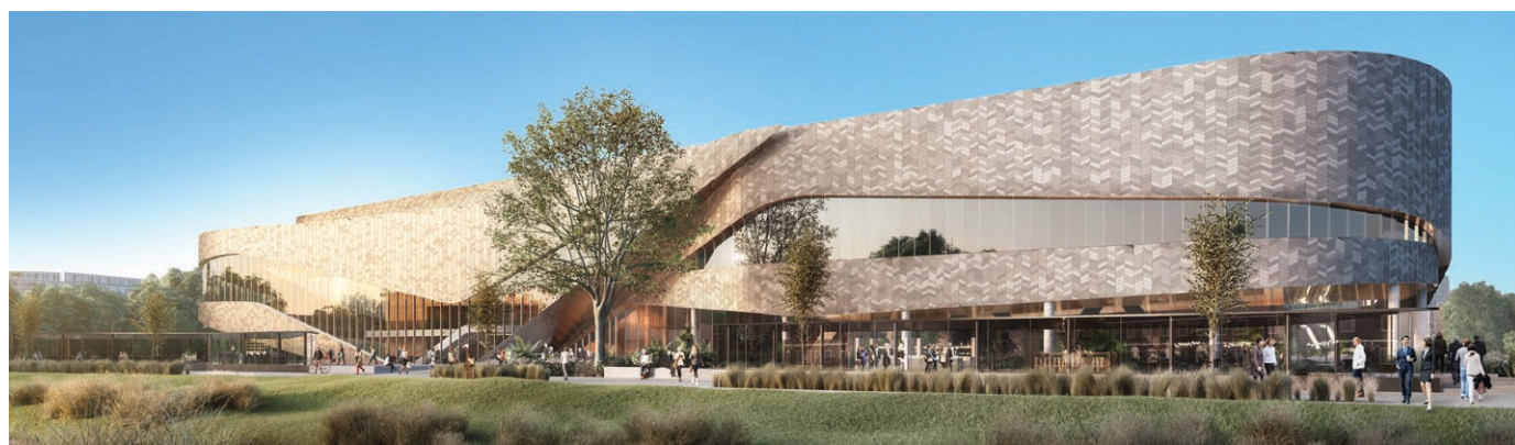
Artist impression, courtesy of Woods Bagot / Warren and Mahoney.