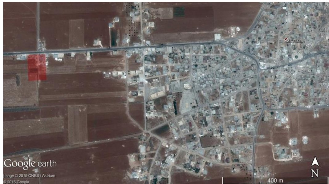
Area outside Maasran where unexploded cluster submunitions were found (in red) following a suspected Russian air strike on 6 October 2015. Imagery date: 18 June 2014. Coordinates: 35.706833, 36.791472

the area on 6 October. 52 Syrian government forces are not considered to be capable of delivering SPBE series submunitions, making it even likelier that Russian armed forces were responsible for their deployment. 53