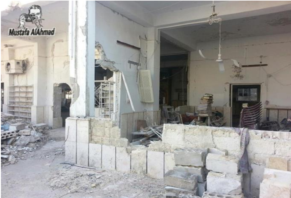
Image of the Omar Bin al-Khattab mosque in Jisr al-Shughour, which was hit by an air strike on 1 October 2015 © Mustafa al-Ahmad.

On 1 October 2015 a Russian Ministry of Defence spokesperson stated that Russia's air force had targeted IS infrastructure and had destroyed one such command post in Jisr al-Shughour. 23 On 30 October, following the emergence of reports and images showing that the Omar Bin al-Khattab mosque had been destroyed, Colonel-General Andrey Kartapolov stated that such information was a "hoax" and presented a satellite image claiming that the mosque was still intact. 24 However, the satellite image showed a different mosque, not the one destroyed in the attack.