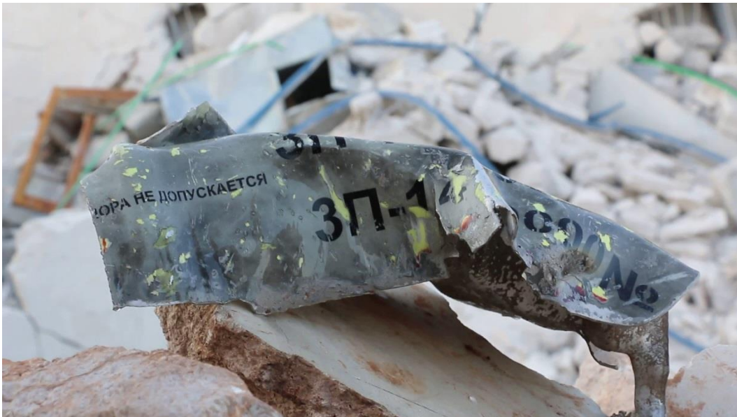
Remnant of Russian Kalibr cruise missile. Still taken from video