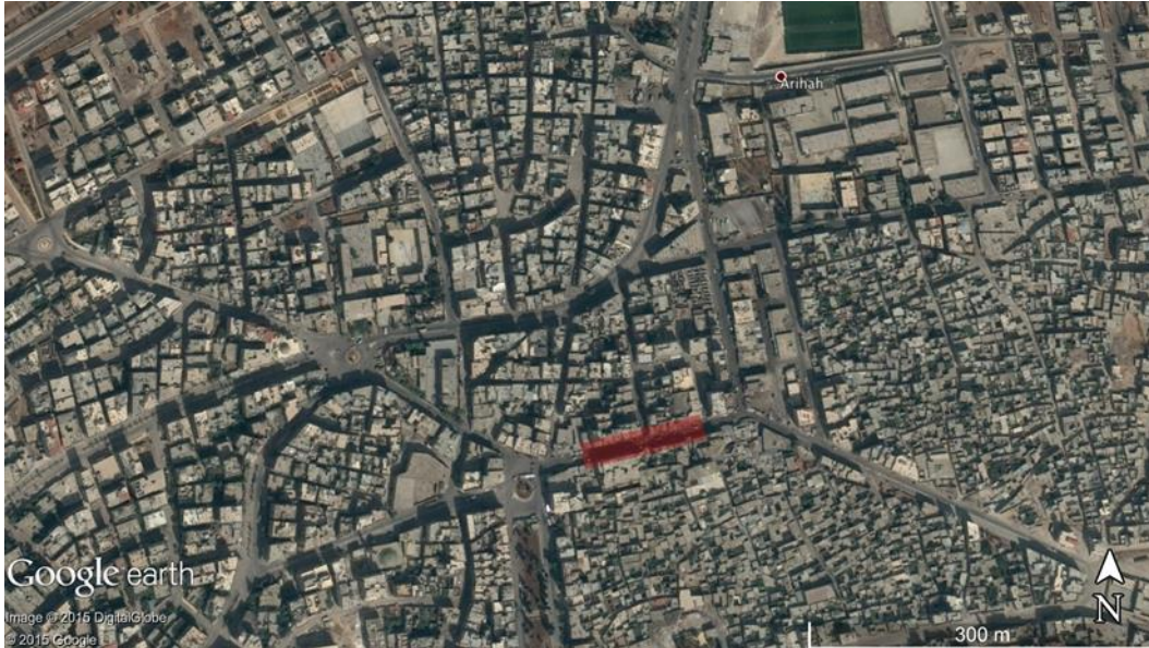
Impact location (in red) of a suspected Russian air strike on a market in Ariha on 29 November 2015. Imagery date: 23 September 2014. Coordinates: 35.813144, 36.610613

Amnesty International is not aware of any statement by the Russian authorities acknowledging or denying responsibility for this attack despite several reports claiming that Russian forces were behind it, including one by Human Rights Watch. 34