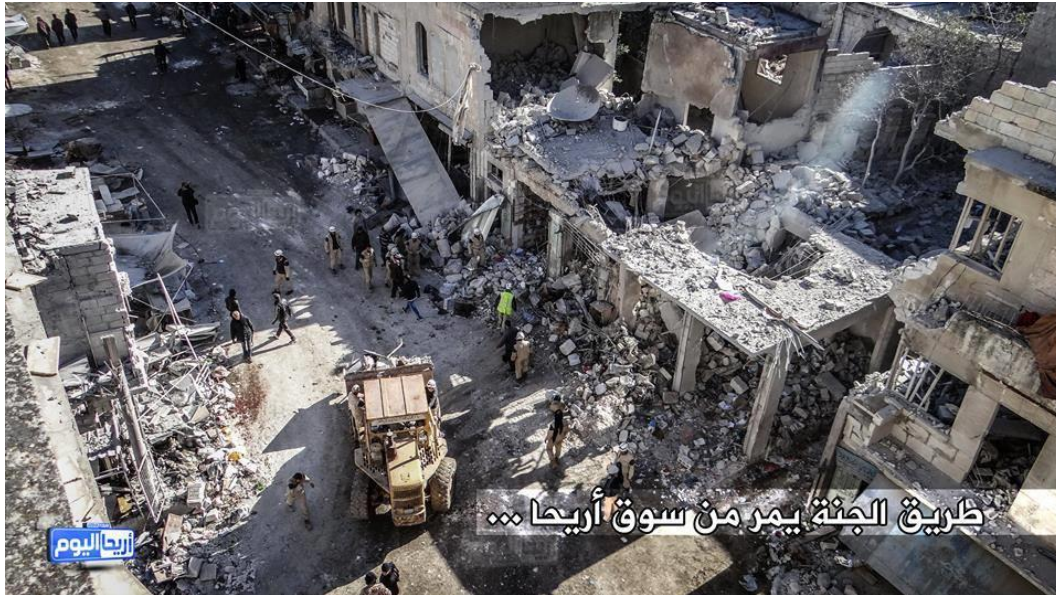
Damage to Ariha market area after 29 November 2015 air strike © Muhammad Qurabi al-Ghazal.

A second activist, “Abu Diab” 39 , told Amnesty International: