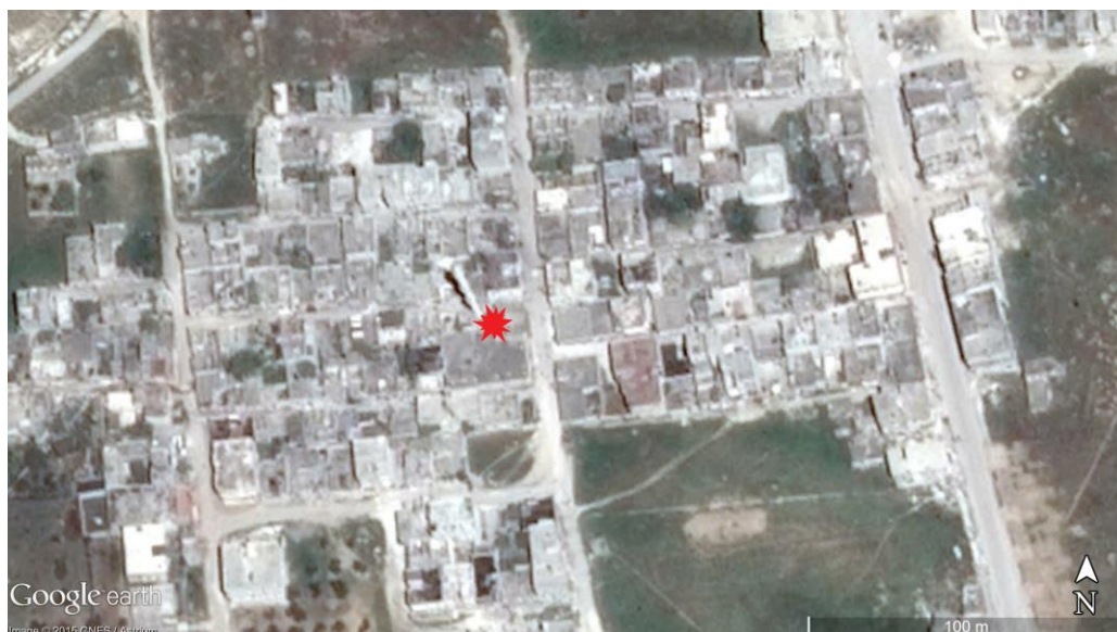
Location of suspected Russian air strike on the Omar Bin al-Khattab mosque in Jisr al-Shughour on 1 October 2015. Imagery date: 14 April 2014. Coordinates: 35.821100, 36.322129

Also on 1 October 2015, at around 11am, a suspected Russian air strike on the Omar Bin al-Khattab mosque in central Jisr al-Shughour, Idlib governorate, killed one civilian immediately, mortally wounded another and injured six more; Amnesty International has obtained the names of all eight individuals. 18 According to one eyewitness interviewed by Amnesty International, there were no military casualties and no military targets in the vicinity, with the nearest checkpoint some 500m away. 19 Reports by Syrian human rights organizations give similar accounts. 20