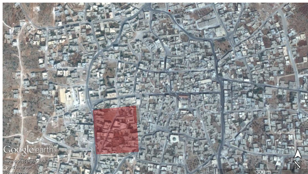
Approximate impact location (in red) of suspected Russian cruise missile strike in Darat Izza on 7 October 2015. Imagery date: 25 August 2014. Coordinates: 36.281051, 36.849916

Five civilians, including two women, four of whose names have been obtained by Amnesty International, were killed on 7 October 2015 when a suspected Russian sea-launched cruise missile struck residential buildings in Darat Izza, Aleppo governorate. More than six residential buildings with at least a dozen homes were destroyed by the attack according to an eyewitness interviewed by Amnesty International as well as reports of human rights organizations. Information provided by local human rights defenders, Syrian human rights organizations and video clips of the aftermath of the attack reviewed by Amnesty International indicated that there was widespread destruction and damage but no military casualties nor any armed presence in the town. 25