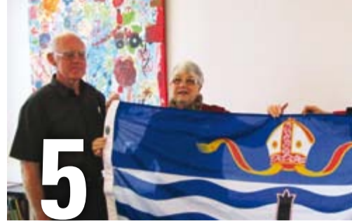
Flag to Danish Mayor

NELSON CITY COUNCIL Making Nelson a better place