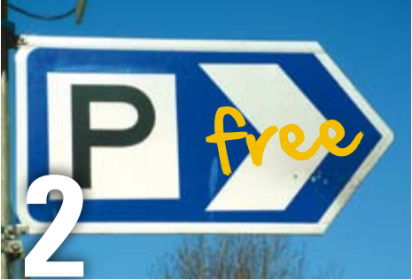
Free Tuesdays are back