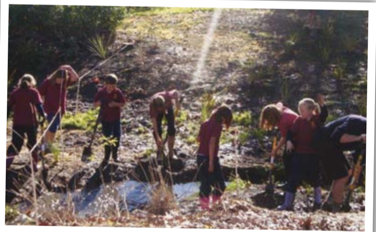
Stoke School children take to the spades at Saxton recently planting cabbage trees, nikau palms and kowhai.

"BLOQX" climber, a "Miram" skate track and a "Supernova" roundabout. Shade sails, lighting, landscaping, and the addition of a lookout platform later this year will complete the improvements.