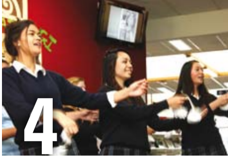
Maori Language Week