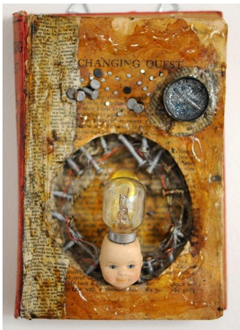
Changing Quest by Eryn Gribble