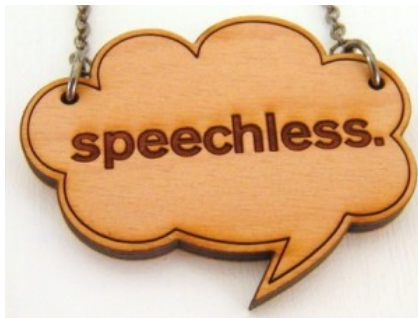
Wooden necklace by Implant