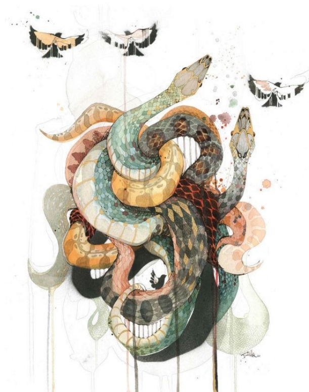
Snake Nouveau by Rachel Walker