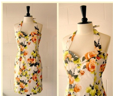
Vintage flower dress by Samantha Wakelin

The Matchbox Boutique offers a unique shopping experience featuring beautiful and colourful designs, hand crafted by over 30 different local, national and international makers. Matchbox Boutique offers an accessible platform for independent, emerging and established designers to showcase their individual collections. The boutique hires display spaces with no commission, meaning that designers keep 100% of the money that they make from their designs.