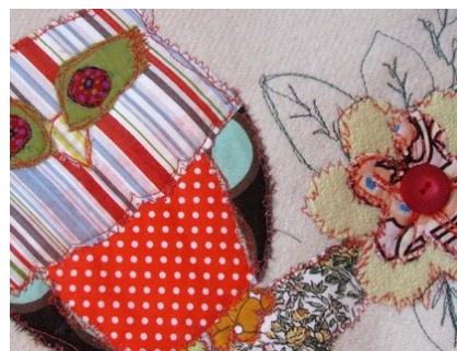
Appliqué cushion by Firecracker Designs

Matchbox Photography Studio is available for hire, with rates ranging from $55 for an hour, $180 for a half day to $280 for a full day. The studio comes fully equipped and has excellent natural light.