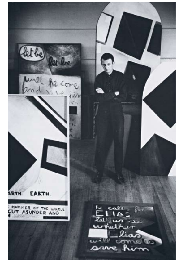
Colin McCahon in the attic studio, Auckland City Art Gallery, 1963.