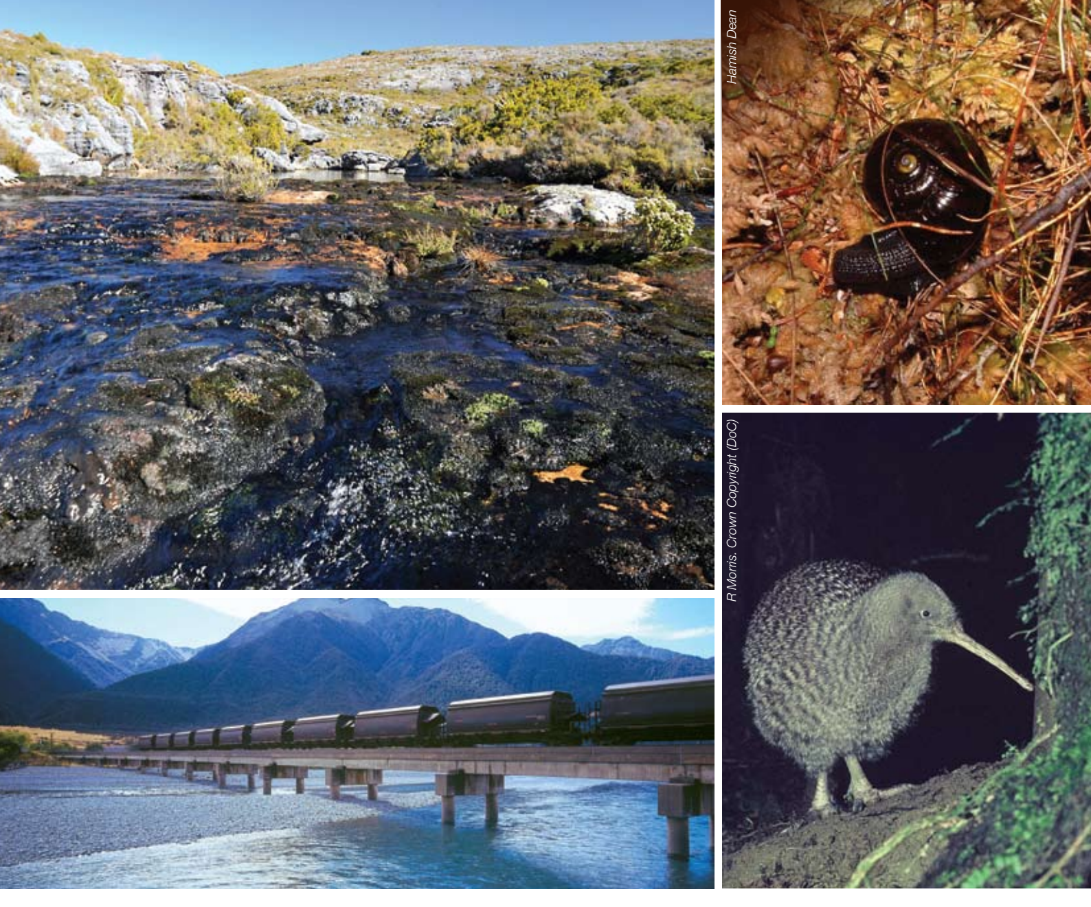
The headwaters of St Patrick Stream (top left) is home to a bryophyte plant community and will be isolated from mining activity. An extensive and long-running predator control programme will mitigate the impact on Powelliphanta "patrickensis" snails and Roroa (Great Spotted Kiwi). Stockton's high-quality steel coal is carried 400 km to Lyttelton Port of Christchurch for ship loading and export.

environmental standards. Rehabilitation of the site will be progressively carried out over the life of mining in the area and a variety of controls and protections will be implemented to ensure the development has the least possible impact on native wildlife, fauna and water quality.