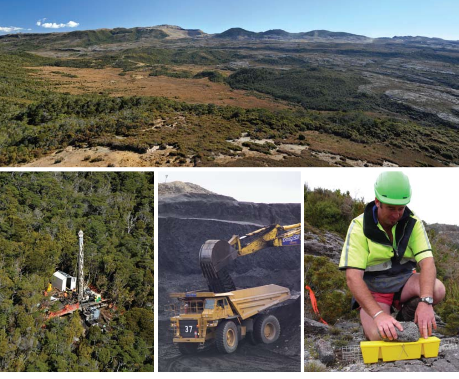
The Cypress area is immediately to the east of the current Stockton operational area, some of which can be seen near the skyline of the top photograph. An extensive resource drilling programme, begun in late 2008, will run until early 2010. Coal from a number of mining pits at Stockton is blended to fill customer orders. The Cypress extension will result in another 3,000 hectares of native bush areas receiving extensive predator control for 30 years.

and released its decision in May. The Court upheld the councils' decision, subject to an extensive set of conditions that represented the outcomes of negotiations with a number of parties, including DoC and Ngakawau Riverwatch. A final appeal, by Forest and Bird on four points of law, was rejected by the High Court in December 2005.