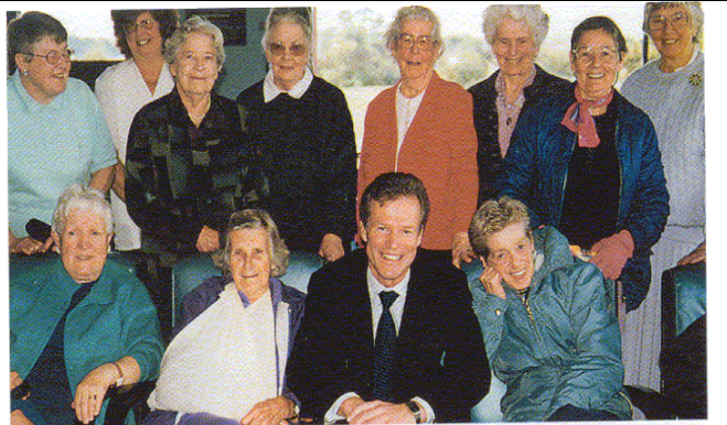
With a group of old friends from Age Concern Rodney