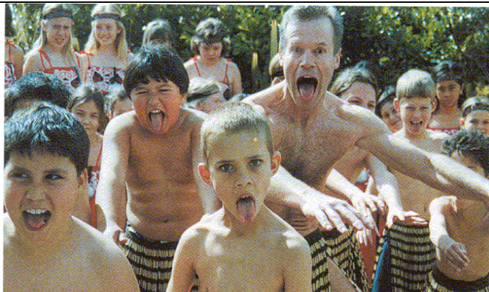
Joining in the Haka with young warriors from Stanmore Bay Primary School Cultural Group.