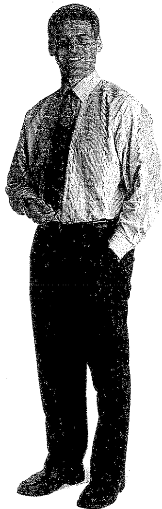
Bill English Leader of the National Party

New Zealand needs a Government that will turn young offenders' lives around. Programmes must be extended to make them repay their debt to the community. We will make drug and alcohol programmes more effective.