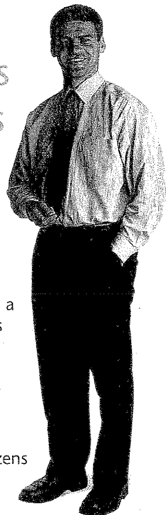
Bill English Leader of the National Party

Every citizen has a right to a fair go and an obligation to contribute. Under National, New Zealanders can look forward to a future with one standard of citizenship.