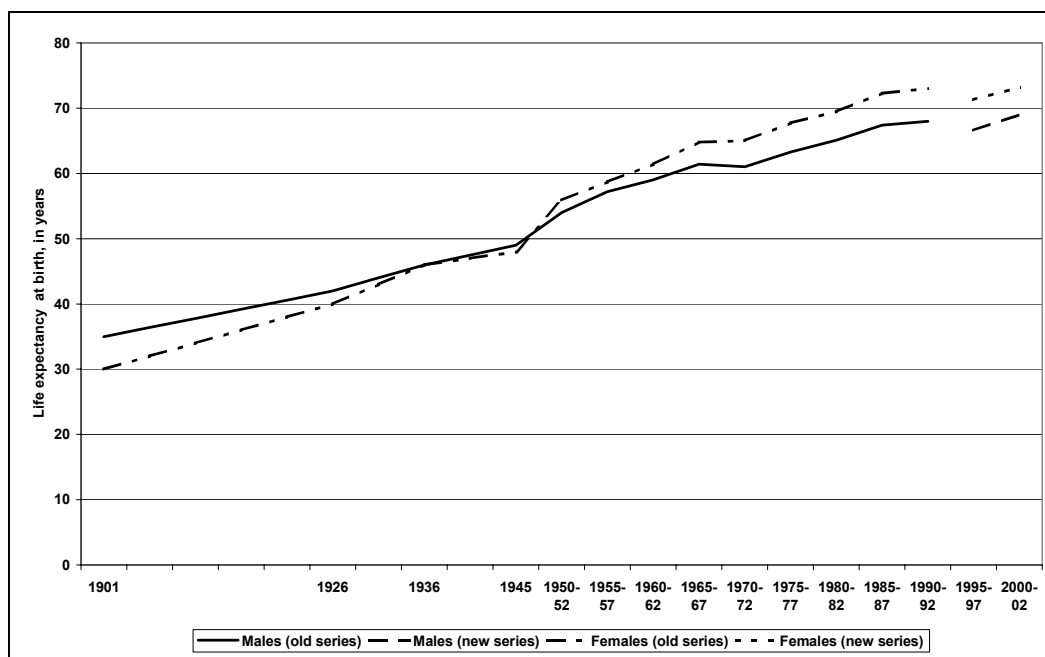
Figure 2: Maori life-expectancy at birth – 1901-2002