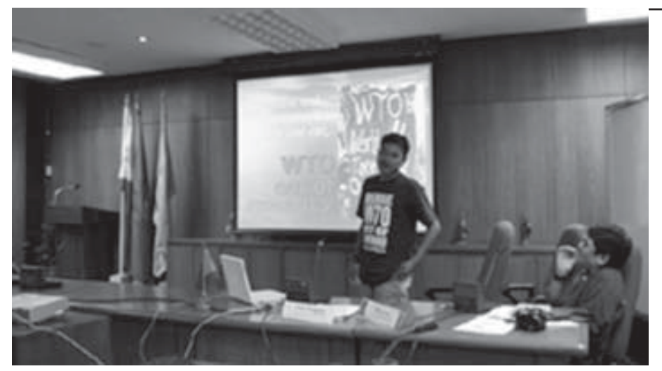
Filipino member of The World Forum of Fisherpeoples (WFF) speaking at a meeting in Hong Kong