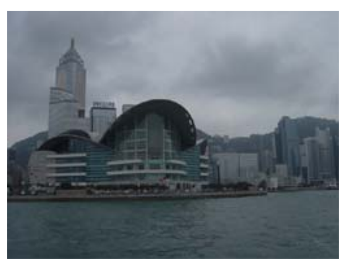
The Hong Kong Convention Centre

Members : HKPA currently has 31 group members. They include